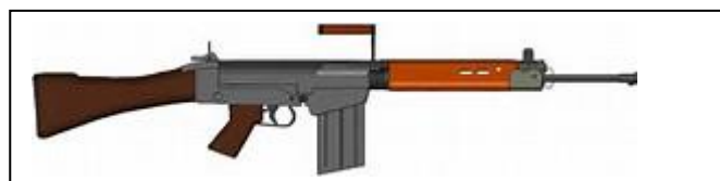
Self-Loading Semi-auto Action

It is only the action that constitutes a firearm