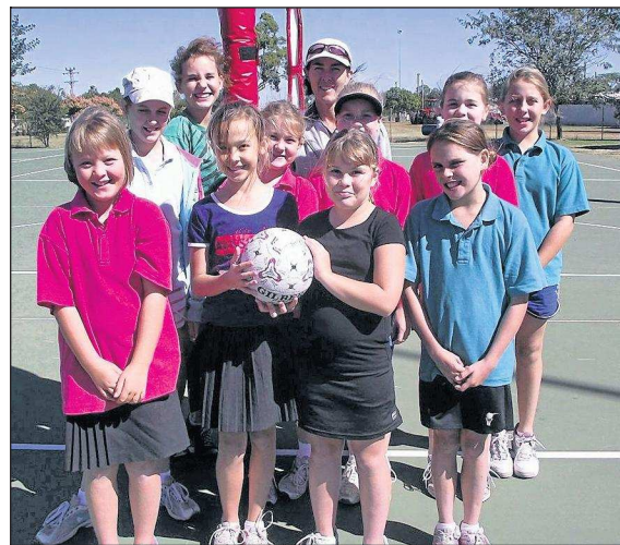
The Netta competition is great for the girls to play.