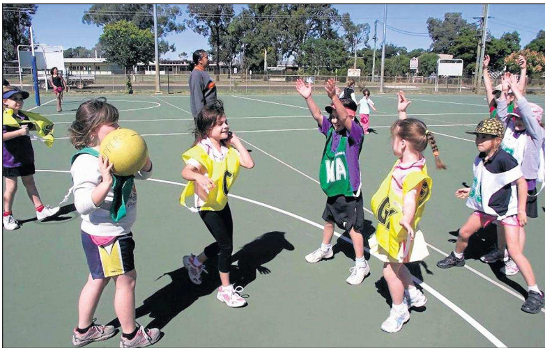
COURT ACTION: The Junior Netta girls enjoy a fun game.