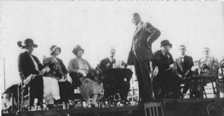
Official Opening of the Gordonvale Memorial Hospital

Gordonvale Memorial Hospital was originally erected as an 8 bed hospital in memory of those who died in service or were killed in action during World War One.