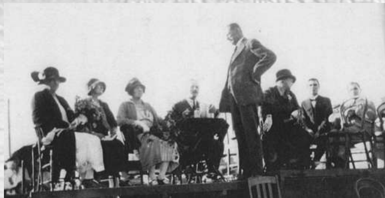
Official Opening of the Gordonvale Memorial Hospital

Gordonvale Memorial Hospital was originally erected as an 8 bed hospital in memory of those who died in service or were killed in action during World War One.